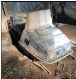
Massey Ferguson 344 Ski Whiz