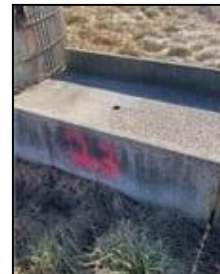
6 ft Concrete Feed Bunk