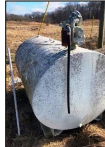
500 gal Fuel Tank