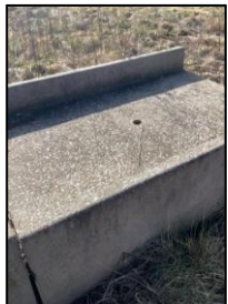
6 ft Concrete Feed Bunk