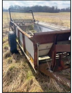
Farmhand Manure Spreader