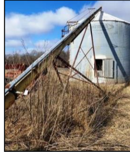
Westfield W80 Auger