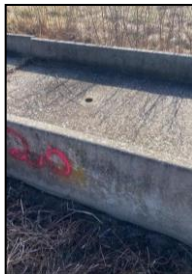
6 ft Concrete Feed Bunk