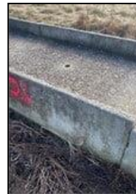
6 ft Concrete Feed Bunk