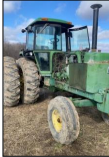
John Deere 4430