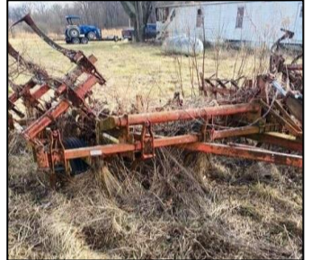
Case 1200 19ft Cultivator