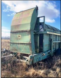
John Deere 200