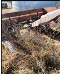
IH 843 Corn Head