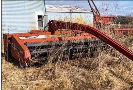
Case 8360 Mower Conditioner

REGISTER/BID NOW at mollettauctions.hibid.com