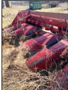
IH 863 Corn Head