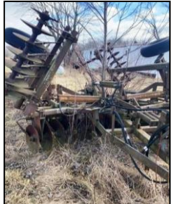
Burch 18ft Disk Remlinger Harrow