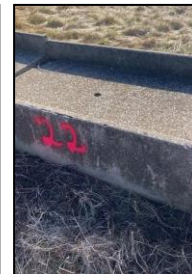
6 ft Concrete Feed Bunk