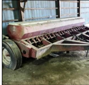
IH 510 Drill