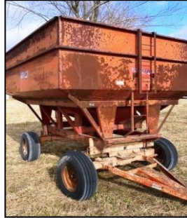
McCurdy Gravity Wagon Clark Gear