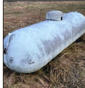
500 Gallon Propane Tank