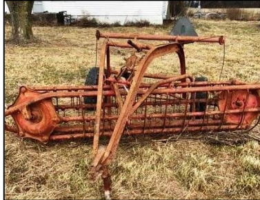
Massey Ferguson 36 Hayrake