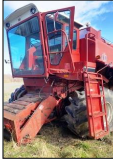
International 1460 Combine