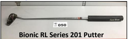
050 Bionic RL Series 201 Putter