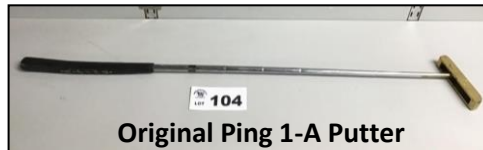
104 Original Ping 1-A Putter