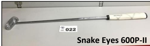
022 Snake Eyes 600P-II