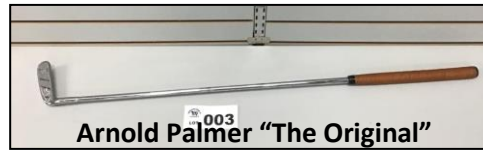
003 Arnold Palmer "The Original"