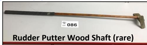
086 Rudder Putter Wood Shaft (rare)