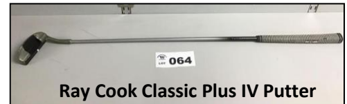
064 Ray Cook Classic Plus IV Putter