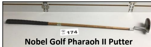
174 Nobel Golf Pharaoh II Putter