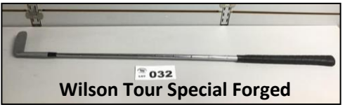
032 Wilson Tour Special Forged

Terms & Conditions: A 4% surcharge will be added to the amount of the purchase and will be charged to your credit card upon settlement of purchases along with a 10% buyer's premium immediately following the close of the auction. Buyers who wish to pay in cash or by check (Prior arrangements need to be made before auction closes OR by adding to your notes at registration of this sale) upon pickup will have no surcharge but will still be charged a 10% buyer's premium. Items not picked up in 7days WILL BE DISPOSED OF OR RESOLD BY MOLLETT AUCTION SERVICE (original buyer of items will have no right to proceeds of said items)