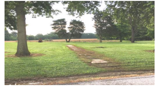
Tract 2: 2.13 Acre Home site