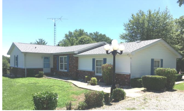
Tract 1: Home, Outbuildings and 7.98 acres